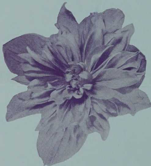
NEW CACTUS TYPES, FRILLED, RUFFLED AND HIBISCUS TYPES IN MANY COLORS.

READY FOR SHIPMENT IMMEDIATELY FOR EARLY SALE AND PLANTING